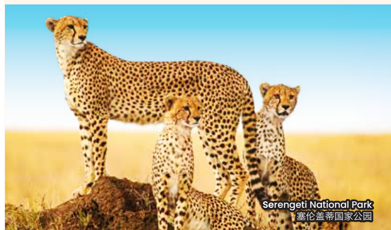
Serengeti National Park 塞伦盖蒂国家公园

*MOB=Meals on Board/HB=Hotel Breakfast/PL=Picnic Lunch/LL=Local Lunch/CL=Chinese Lunch/LD=Local Dinner