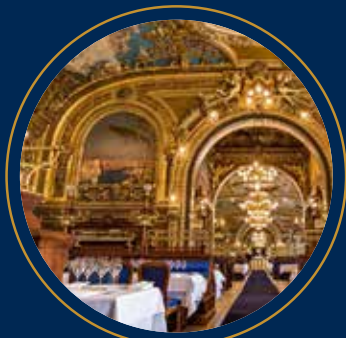
Le Train Bleu is a legendary Parisian restaurant known for its opulent Belle Époque decor and refined French cuisine. 一间拥有百年历史的经典法式餐厅。金碧辉煌的巴洛克风格装潢，搭配精致法式料理，让你仿佛穿越回优雅的黄金年代。

精心安排的当地特色菜肴，亲自品尝美食，通过味蕾传达的激动，深入探索蕴含在食材中的传统文化。 感受到厨师对家乡的深厚情感，呈现出原汁原味的烹饪技艺，让人感动不已。