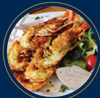
Icelandic Langoustine 冰岛小龙虾