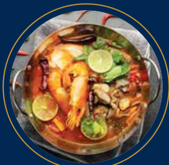
Thai Meal 泰式餐