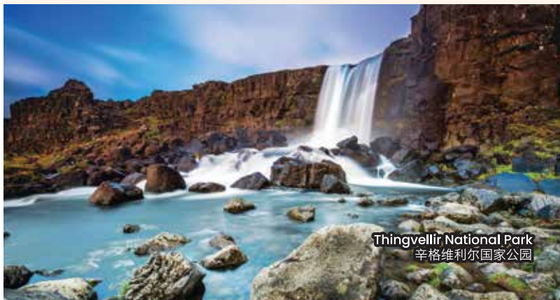
Thingvellir National Park 辛格维利尔国家公园

行程次序以当地旅行社安排为准。行程, 膳食, 住宿, 交通等可能会因不可抗拒因素而更动, 恕不另行通知。