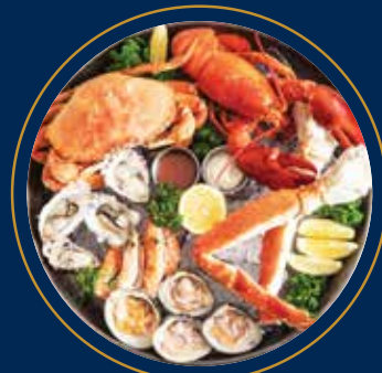
Seafood Platter 海鲜拼盘