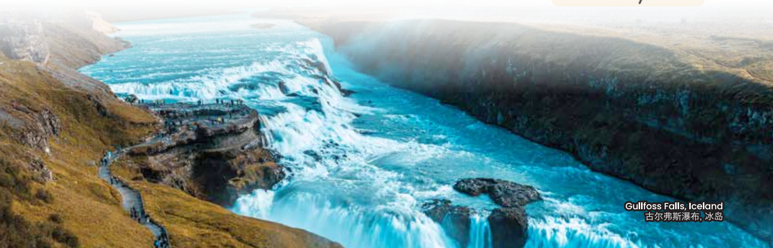
Gullfoss Falls, Iceland 古尔弗斯瀑布, 冰岛