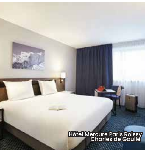
Hôtel Mercure Paris Roissy Charles de Gaulle