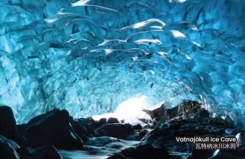
Vatnajökull Ice Cave 瓦特纳冰川冰洞