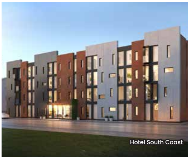
Hotel South Coast