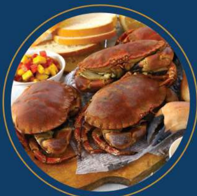
Brown Crab 面包蟹