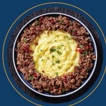
Reindeer Meat 驯鹿肉