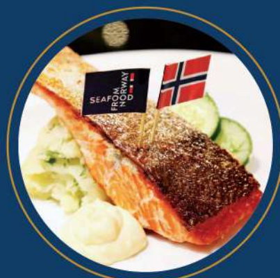
Norwegian Salmon 挪威三文鱼