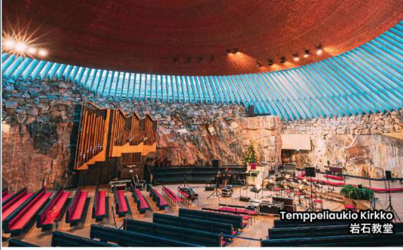
TempPELLIAUKIO KIRKKO 岩石教堂