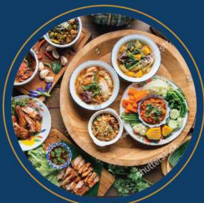
Thai Meal 泰式餐