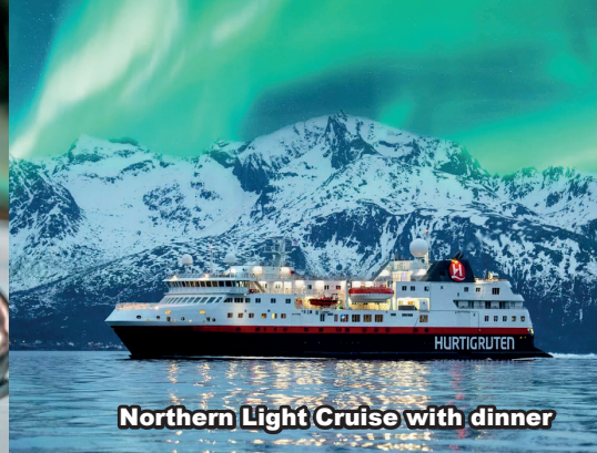
Northern Light Cruise with dinner