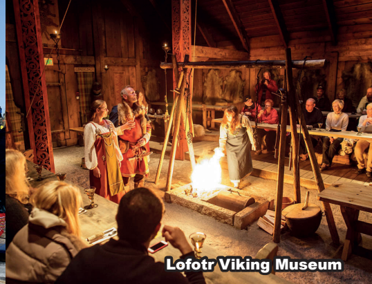
Lofotr Viking Museum