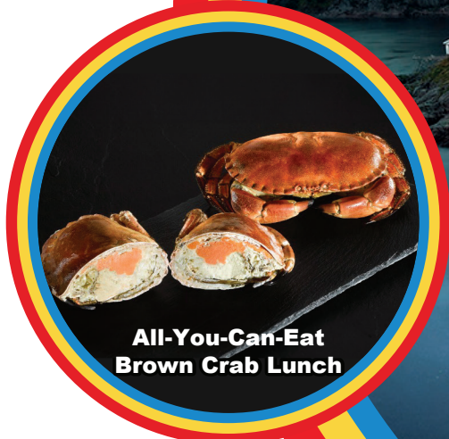
All-You-Can-Eat Brown Crab Lunch