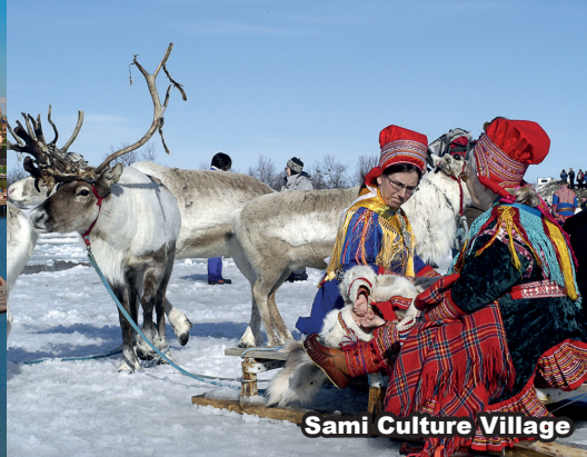
Sami Culture Village