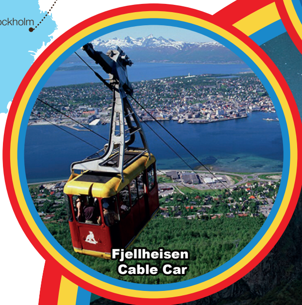
Fjellheisen Cable Car