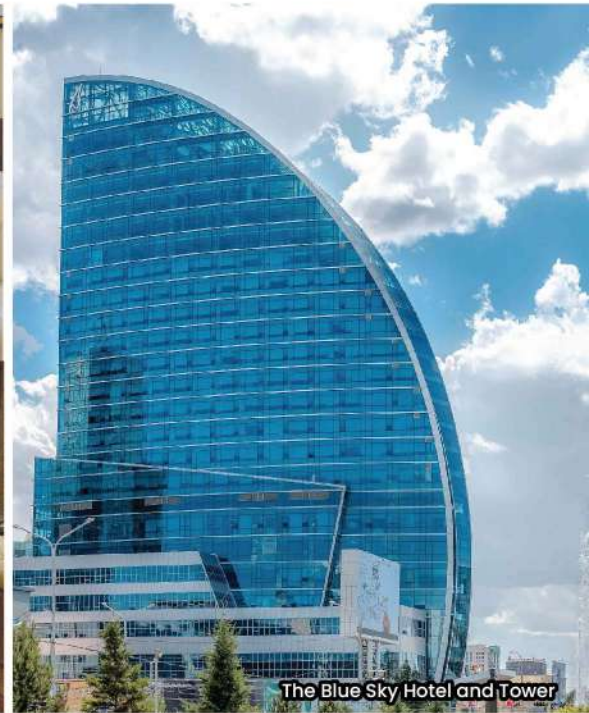
The Blue Sky Hotel and Tower