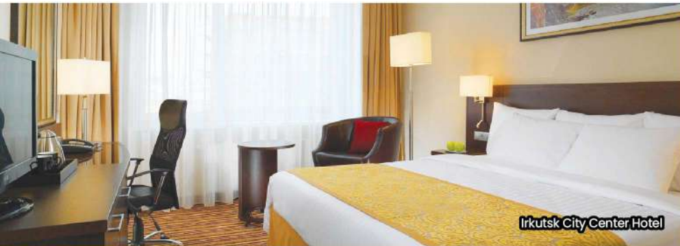
Irkutsk City Center Hotel

Embark on a complete journey at 4+5-star hotel, offering a quality & comfortable stay. 全程安排4+5星级酒店, 让您在整个旅程中享受到有质量且舒适的住宿环境。