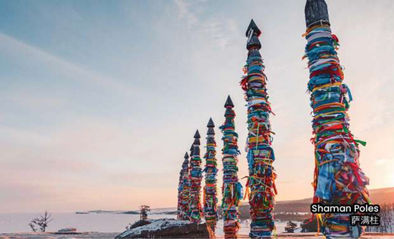
Shaman Poles 萨满柱