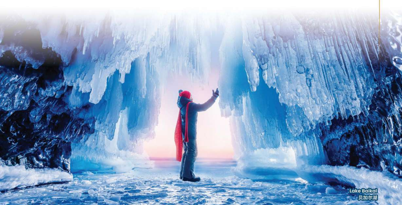
Lake Baikal 贝加尔湖