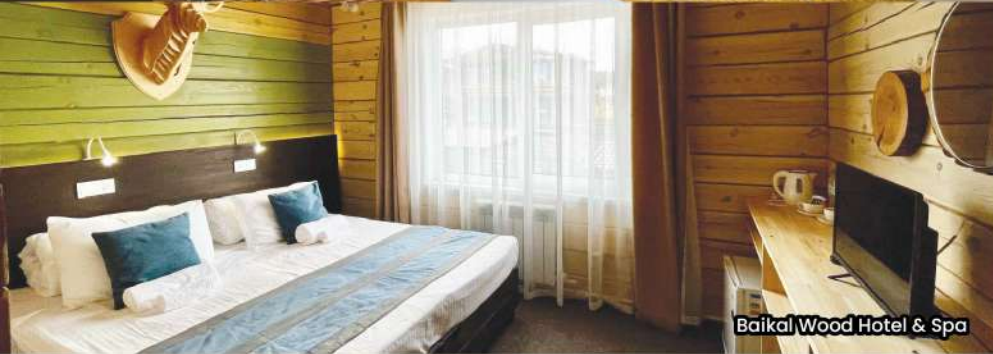
Baikal Wood Hotel & Spa