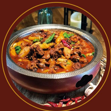
Braised Goose & Steamed Buns 喀纳斯特色红嘴雁焖花卷