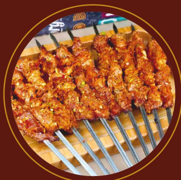
Xinjiang Flavour 新疆雪都风味