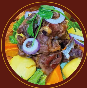
Kazakh Specialty Meals 哈萨克族特色晚餐