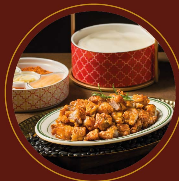
Huaiyang cuisine 胡杨河淮扬菜