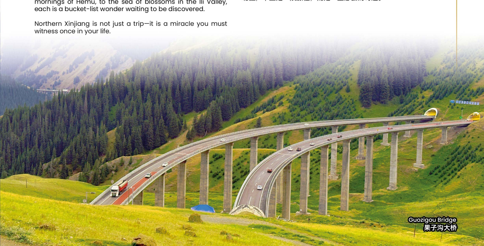
Guozigou Bridge 果子沟大桥