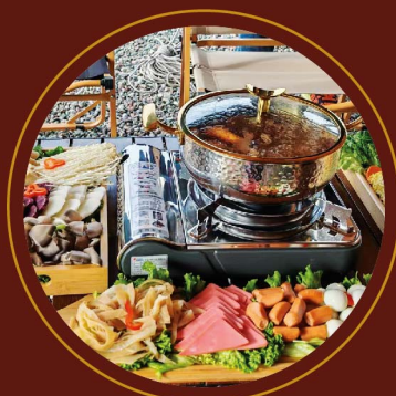
Grassland Hot Pot 私人牧场草原火锅