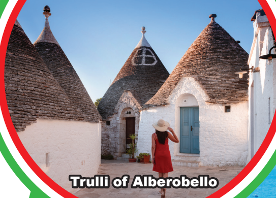
Trulli of Alberobello