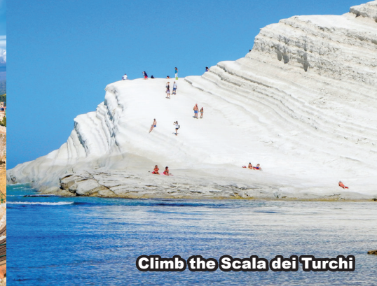
Climb the Scala dei Turchi