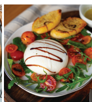
Mozzarella di Bufala