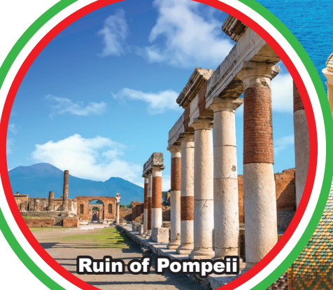
Ruin of Pompeii