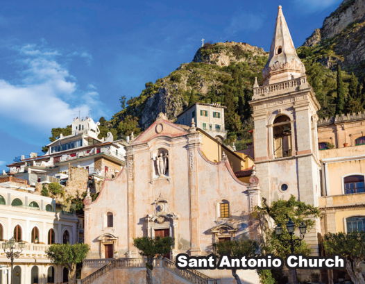
Sant Antonio Church