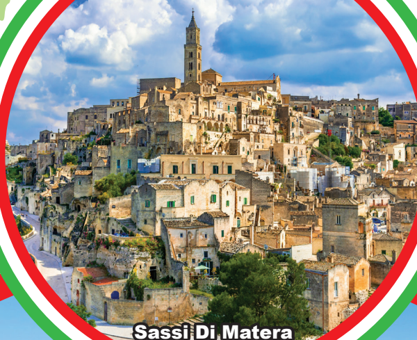
Sassi Di Matera