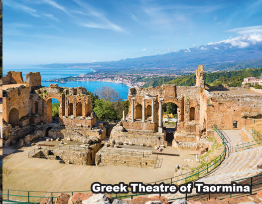
Greek Theatre of Taormina