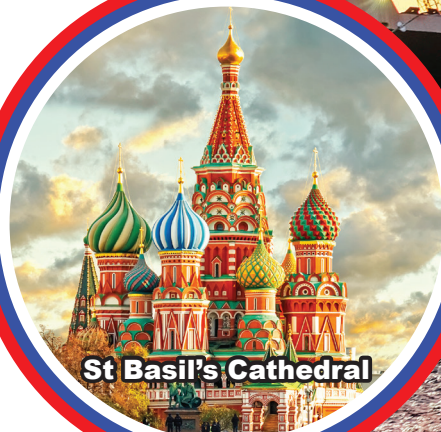
St Basil's Cathedral