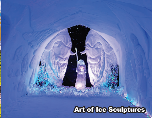
Art of Ice Sculptures