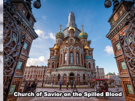
Church of Savior on the Spilled Blood