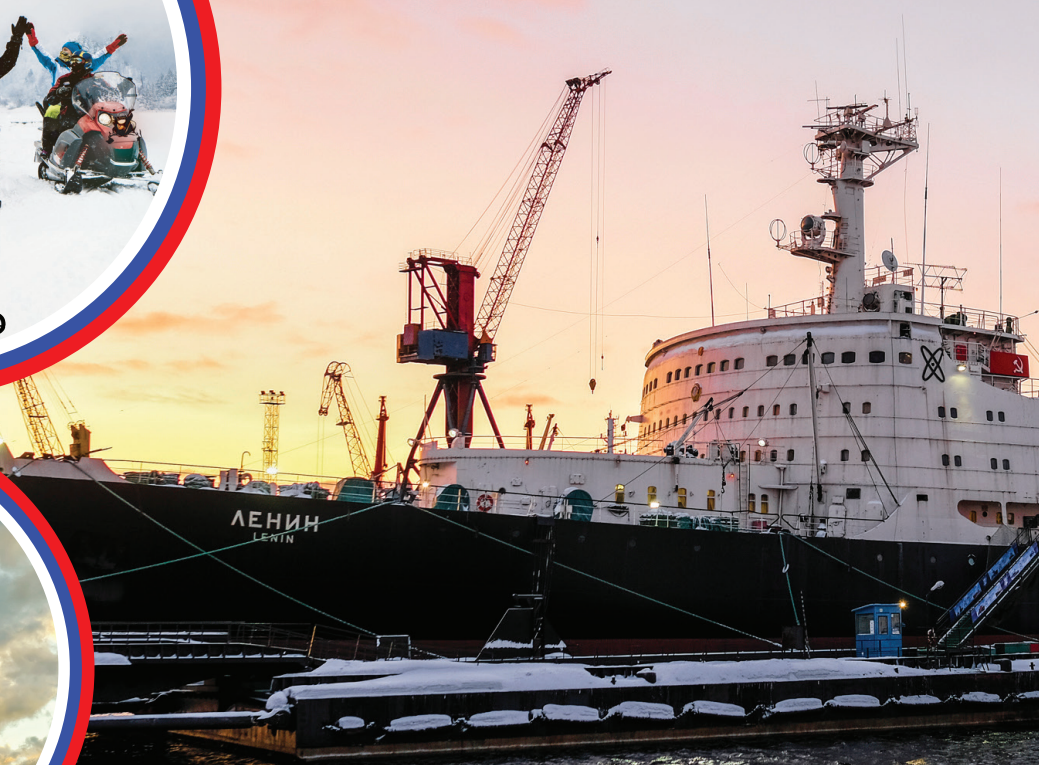
Nuclear-Powered Icebreaker "Lenin"