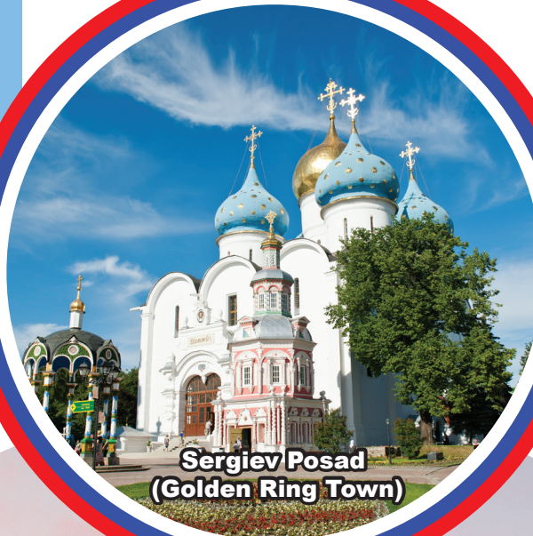
Sergiev Posad (Golden Ring Town)